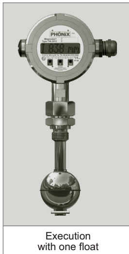
Execution with one float